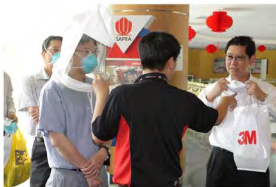
The seminar ended with a mask fitting demonstration and a mask fitting exercise and each participant was given a bag of PPE items.

Thus far, there is no major change in the characteristics with regards to the efficiency of transmission from human to human. The case fatality, however, has