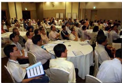
Influenza Pandemic Planning Seminar held at SAFRA Mount Faber, 7-8 February 2009.

The organisers agreed that they were indeed pertinent questions and concerns that deserved considerations. ■ CM