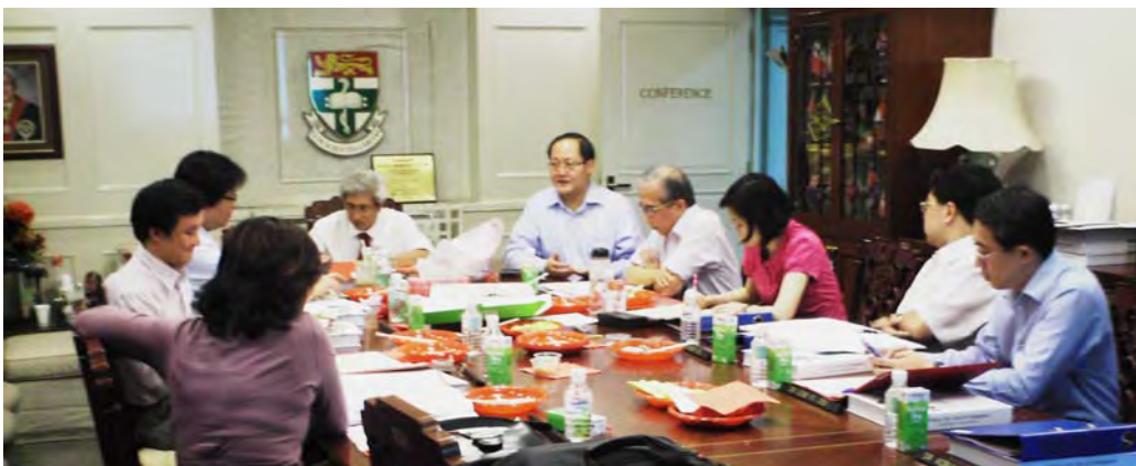
The College wholeheartedly supports the establishment of the Register of Family Physicians (FPR) as it will enhance the practice of family medicine. (Photo: Council Meeting at the College Conference Room)