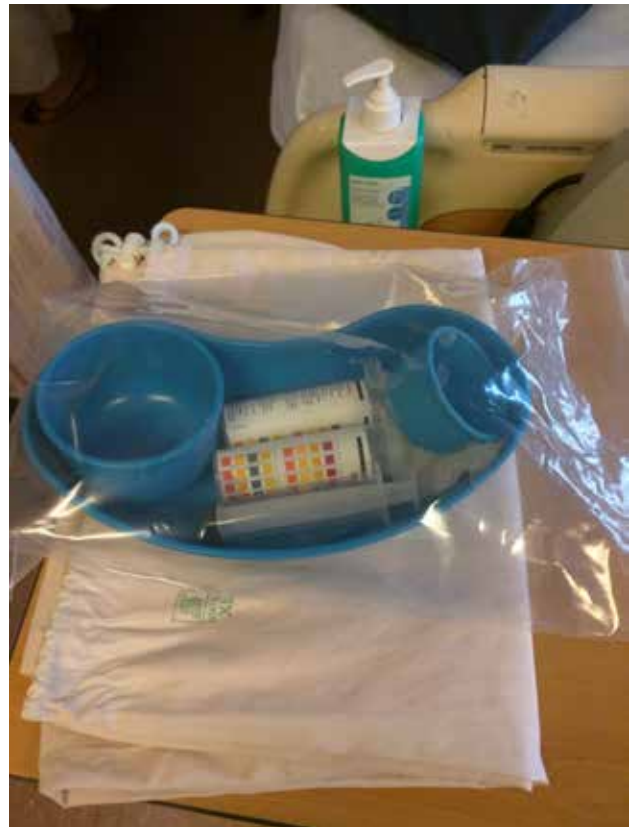
Figure 2: Enteral feeding kit (kidney dish, gallipot, pH papers and syringe)