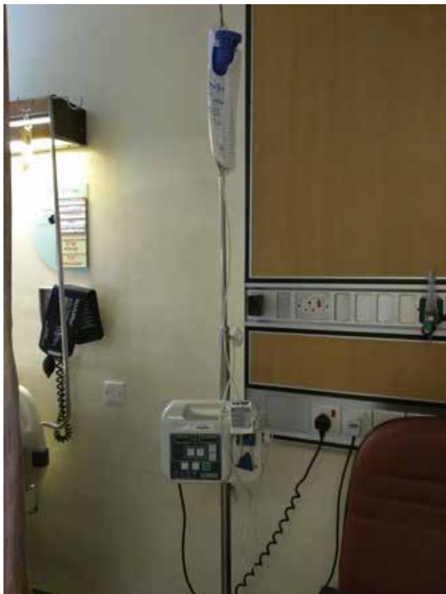
Figure 3: Compact pump for continuous NGT feeding