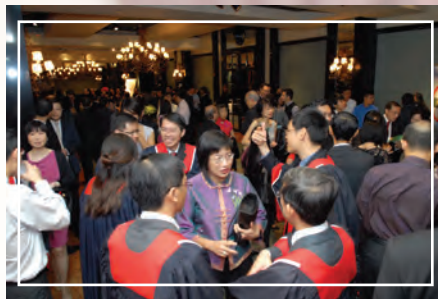
Guests mingling around before the 40th Anniversary Dinner at Grand Ballroom, Grand Hyatt Singapore.