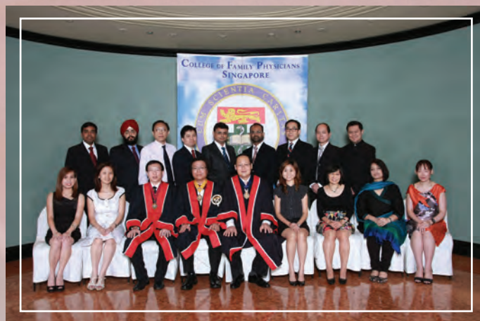
GDFM Graduands Year 2011