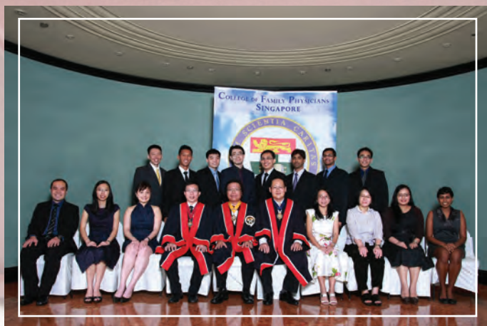
MMed(FM) Graduands Year 2011