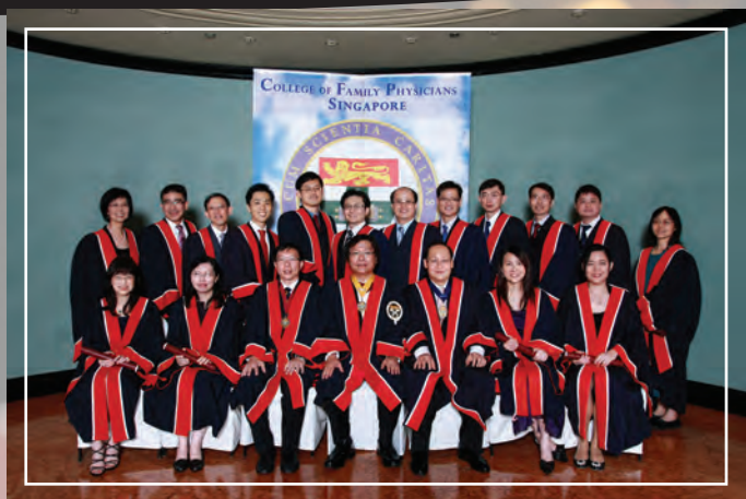
FCFP(S) by Assessment Recipients