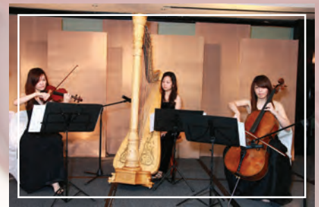
Live Performance by I-Sis Trio, during the 40th Anniversary Dinner.