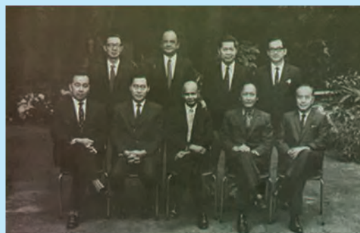
1st Council, College of Family Physicians Singapore.

The renaissance of the interest in Family Medicine started in the United Kingdom and the United States in the early fifties. The increased specialisation in the US forebodes the exit of the Family Physician. This was an alarming trend as the onus of