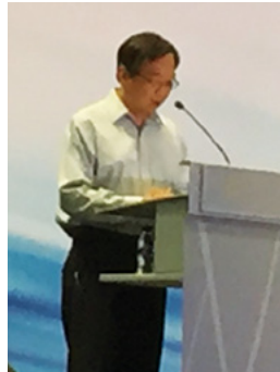
The Guest of Honour for the event, Mr Gan Kim Yong, Minister for Health

About 250 health care workers and volunteers from healthcare institutions in Singapore gathered at the Suntec Convention Centre on the afternoon of 8 Oct 2015, to commemorate the launch of the SG50 book "Caring for our People Celebrating 50 Years of Healthcare in Singapore". The event was organized by the Ministry of Health (MOH) and graced by Mr Gan Kim Yong as the guest of honour.