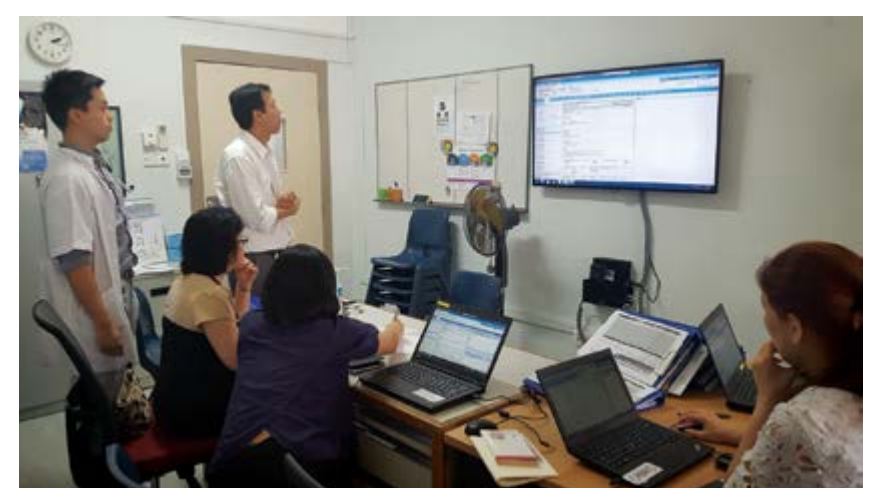
Multi-disciplinary team discussion of patients in IMH

I think most of us would not have expected to cross institution borders to deliver care, as delivery of clinical