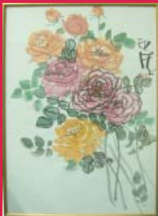
"Roses" by Dr Earl Lu, From College Art Collection

College of Medicine Building 16 College Road #01-02 Singapore 169854 Tel: (65) 62230606 Fax: (65) 62220204 Email: collegemirror@cfps.org.sg