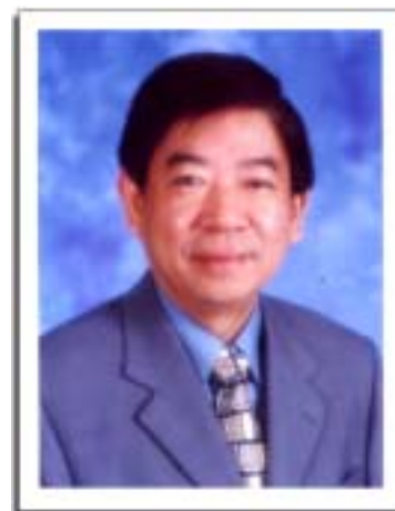
Acting Minister for Health Mr Khaw Boon Wan